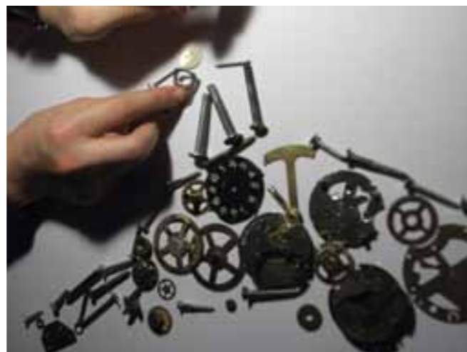
Creating a moving image from metal cogs