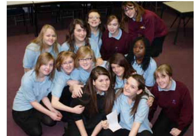
The Voice taking a break from rehearsals.