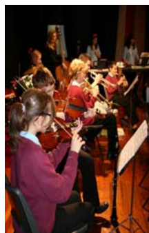
Autumn Music Concert November 2008