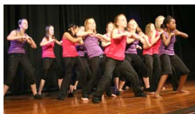
Dance Showcase June 2009