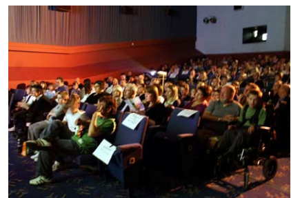
Audience enjoy the 4th Community Film Festival, April 2009 at Hollywood Cinema