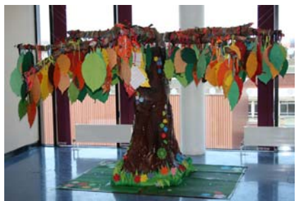
The Far Tree from 'Let's Talk' Project 2008-09