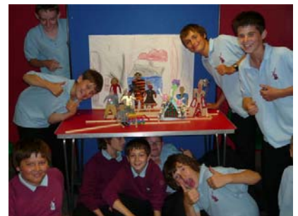
Norwich Castle hosts the Great British Art Debate, July 2009

Arts Director, Specialist Status (Performance Arts & Media)