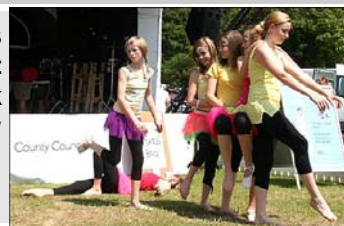
Sprowston's Got Talent, April 2009.

Performing Arts students took part in The Merchant of Venice at The Norwich Playhouse as part of the